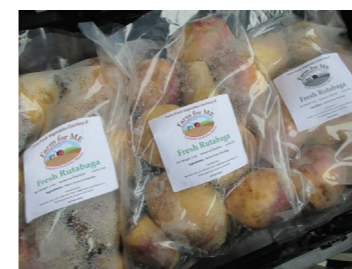
Fresh rutabagas are flash-frozen and packaged for distribution beyond the growing season