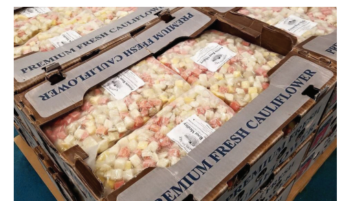
Farm for ME's flash frozen veggies ensures healthy options for food pantries all winter long.

We provide comfort, we feed the hungry, we stand for the vulnerable, we seek wholeness, we bring recovery, we teach the children, we offer support to seniors, we strengthen families, we welcome strangers, we change lives. WE ARE CATHOLIC CHARITIES MAINE!