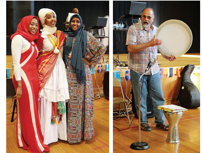
World Refugee Day celebrated the cuisine, music and art refugees bring to our communities.