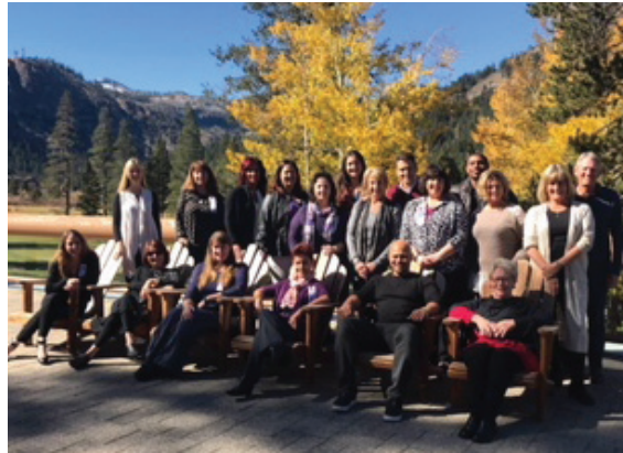
2017 National CACFP Forum attendees at California Roundtable Conference.

hunger insecurity affecting 200,000 people in Maine we're committed to leading the way to a Maine where no one goes hungry.